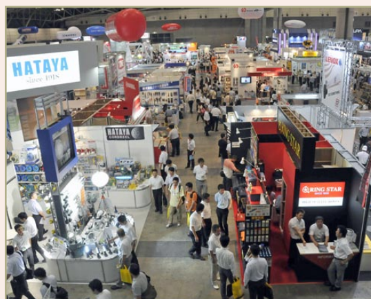
*Photo from the previous show

The show theme for the JAPAN DIY HOMECENTER SHOW 2012 is “Make Your Dreams Your Power!”. This year, the show welcomes its 48th anniversary. We will try to produce the show that that can be fundamental strengths to support people’s lives in Japan by having companies from a wide range of categories participating in the show, reorganizing and expanding exhibition items in order to realize a satisfactory matching with visitors, and having innovative plans ready.