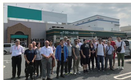
Study Bus Tour to Retail Stores

For the details of the exhibition plans, please go to the official website or contact the secretariat office listed below.