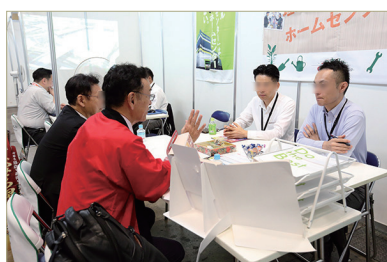
HOMECENTER BUSINESS MATCHING

“Study Bus Tour to Retail Stores” is designed to visit a big home improvement center on Sunday, November 8, the day following the final day of the show. Before starting the tour, a seminar about the market conditions of Japan is planned to be presented. Companies planning to exhibit at the next show are welcome to participate. (Participation fees is required).