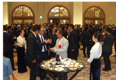
New Year's Celebration Party

For further information, please contact: