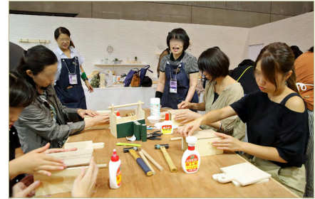
Kirari! DIY Girls

To enhance events more for the visitors, we plan various types of events visitors will enjoy. We will implement a zone targeting males in which you handle professional tools and 'Kirari! DIY Girls', a popular event for a wide range of women to participate, 'DIY Award' honoring celebrities who contributed to the growth of DIY industry, 'Japan DIY Grand Prize 2020' with a total prize of 700 thousand yen, hands-on workshops with a cooperation of exhibitors, T-shirts gifts for first 1,000 people each on the 2 nd and 3 rd day of the show, and other things.