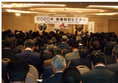
New Year's Special Seminar

On January 29 (Friday), the Japan DIY Industry Association hosted a New Year's celebration party at the Dai-ichi Hotel Tokyo (located in front of JR Shimbashi Station). A New Year's special seminar titled "The endless challenge" was held before the party with Shinji Morisue, a gold medal winner at the Olympic Games, invited as a lecturer. It was packed with over 430 people from member companies and the media.