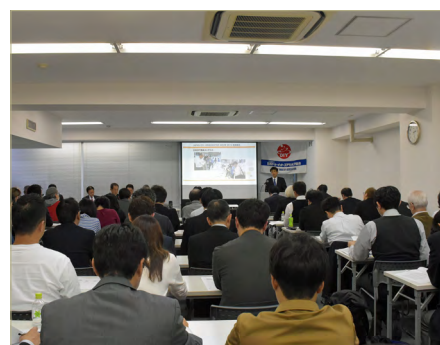
The briefing held in November 2019

JAPAN DIY HOMECENTER SHOW 2020’s executive committee will hold the second briefing for the show at Green Hall on the 3 rd floor of Essam Kanda Hall near kanda Station in Kandasudacho town in Chiyoda ward, Tokyo on February 28 (Friday) at 1:30 PM following the first one in November last year. The show this year will be held for 3 days on November 5 (Thursday), 6 (Friday), and 7 (Saturday), hoping to attract 500 exhibitors from Japan and abroad who will use 1,200 booths, and 100,000 visitors, at International Exhibition Hall of Makuhari Messe in Chiba Prefecture. We look forward to the participation of those from companies and organizations that consider the possibility of exhibiting in the show as well as media people in the briefings.