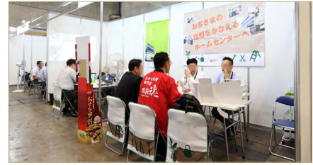
HOMECENTER BUSINESS MATCHING

We plan events for exhibitors such as Japan DIY Products Competition, HOMECENTER BUSINESS MATCHING and Reception Party. This year commemorates the 40 th anniversary of the foundation of Japan DIY Industry Association, and we are planning panels by top managers of big home improvement centers both domestic and overseas including Home Depot from the US and OBI from Europe.