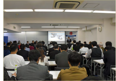
Previous year's briefing (November 2019)

The general meeting and the show executive committee were held on December 18 th (Wednesday) last year while each committee was promoting its own activities. The discussion on ideas for the basic concepts was held with a focus on setting events for exhibitors such as HOMECENTER BUSINESS MATCHING, on theme zones and a theme for the 2020 show. The show theme and details of the show will be told in the next issue.