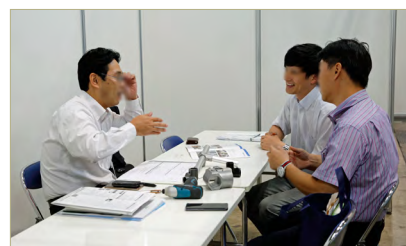
HEMOCENTER BUSINESS MATCHING

In HEMOCENTER BUSINESS MATCHING , exhibitors can have direct business negotiations with buyers from leading home improvement centers at the special booth on the first and second day of the show. There are many chances that exhibitors can start business negotiation. In order to participate, companies are required to make reservations in advance.