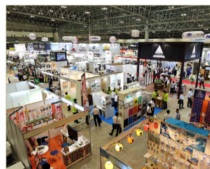
Venue of the previous show