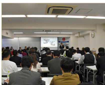
Briefing for the JAPAN DIY HOMECENTER SHOW 2020 was held