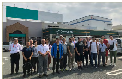
Study Bus Tour to Retail Stores

Study Bus Tour to Retail Stores is designed for overseas exhibitors to visit big home improvement centers around Makuhari Messe on Sunday, the day following the final day of the show. Before starting the tour, a seminar mainly on the market of domestic home improvement centers will be presented by a top manager of a home improvement center. After finishing the tour, participants will have a meeting and information exchange over lunch. A participation expense is necessary.