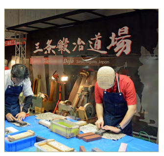
Sanjo Blacksmith Dojo