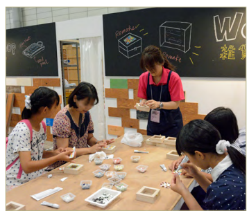
Sparkling! DIY Women