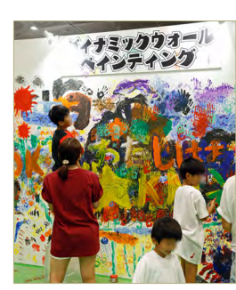
Home Improvement Center for Children