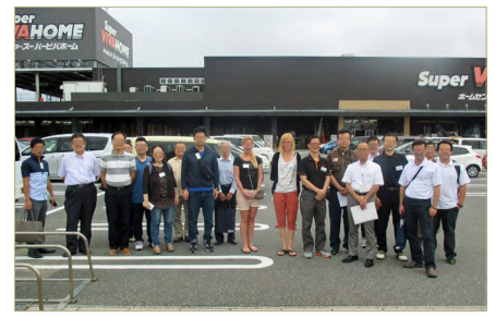
Study Bus Tour to Retail Stores