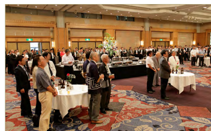
The previous networking party

An industrial networking party will be held on the first day after the show with people from 3 industries (manufacturing, wholesale trade and retailing) attending. The party will give participants the opportunities to exchange information and to get to know each other.