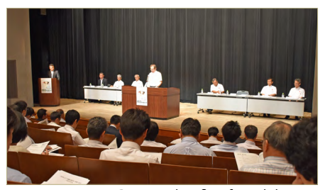
Previous briefing for exhibitors