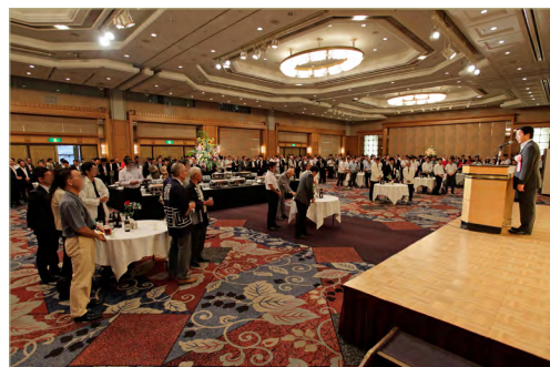
Previous networking party (2015)

Please contact Overseas Operation Office listed below for details of exhibition and events.