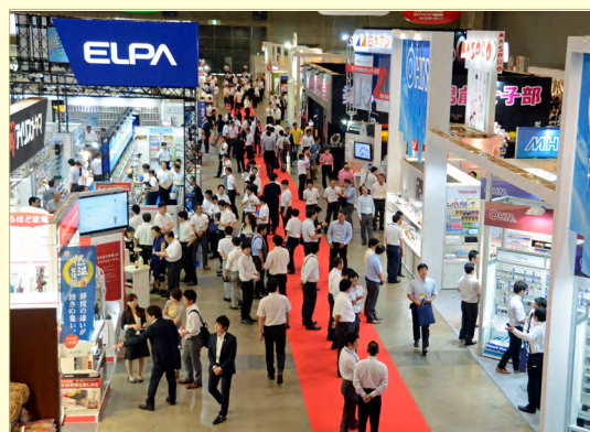
Photo from the previous show

The show theme of the JAPAN DIY HOMECENTER SHOW 2016 is “Let’s DIY: The Joy of Creating, the Joy of Improvement”. In this year’s show, we will advise enjoying DIY with families and friends than just enjoying it alone. We will make efforts to meet people’s expectation by presenting various ideas useful for a living and by arranging innovative events.