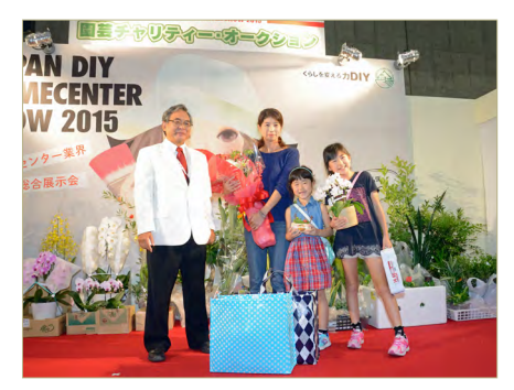
The number of visitors reached 6 million