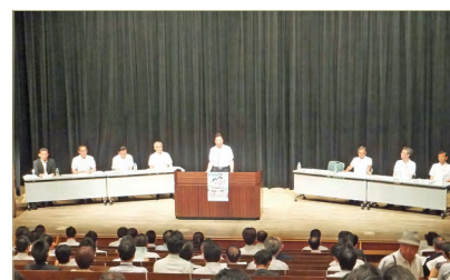
The previous briefing for exhibitors

Chinese website: http://www.diy-show.jp/2015/c/index.html