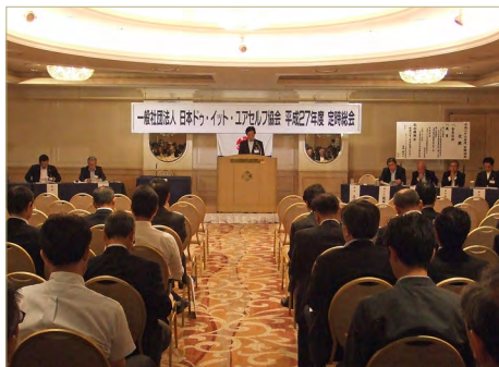
The ordinary general meeting for 2015 and networking party