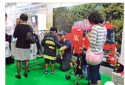
JAPAN DIY HOMECENTER SHOW 2014 venue and event