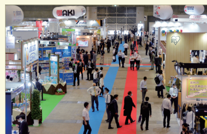
The show held in 2021

The JAPAN DIY HOMECENTER SHOW 2022, one of the largest comprehensive trade show in Japan for housing and living items where domestic and overseas companies related to DIY and home improvement center business gather, is planned to be held for 3 days at Makuhari Messe International Exhibition Hall in Chiba Prefecture from August 25 (Thursday) to 27 (Saturday), 2022.