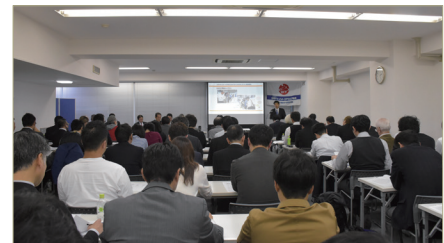
The previous briefing held in November 2019

The first briefing of the show is scheduled for February 2 (Wednesday) at 12:30 p.m. at the Dai-ichi Hotel Tokyo (3 minutes-walk from JR Shimbashi Station). In early February, we will distribute an exhibition information brochure to member companies of the Association, last year’s exhibitors and other companies, related organizations, and government agencies in Japan.