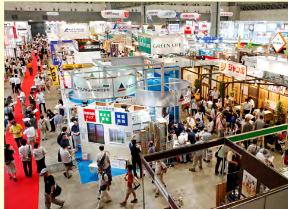
*Photo from the previous show

The show theme for the JAPAN DIY HOMECENTER SHOW 2013 is “Tomorrow is dreamy with DIY! -The world is full of dreams-”. The show that welcomes its 49th anniversary this year will make new and appealing suggestions in order to match exhibitors from a wide range of categories with a great variety of visitors with new exhibition items that focus on DIY activities by women added.