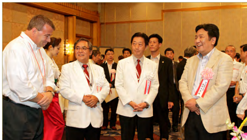
Networking party from the previous year

Companies from 3 industries (manufacturing, wholesale trade, and retailing) participate in our show, which means that the show will provide opportunities for business meetings and information exchange among exhibitors. On the first day, a networking party will be held after the show.