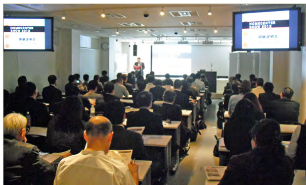
Previous year' s meeting

In the briefing, the details and purposes of the show will be explained to companies that are considering the participation in the 2013 show.