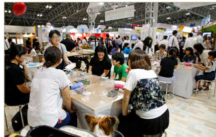
Shining DIY Women