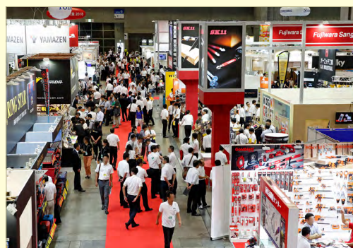
Photo from the previous show

The show theme of the JAPAN DIY HOMECENTER SHOW 2019 is “Discover your own lifestyle with DIY”. 485 companies will exhibit in the show this year, utilizing 1,139 booths (out of which 139 companies are overseas companies from 10 countries or areas and they use 152 booths).