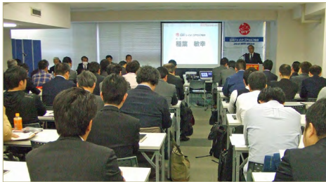
Previous year's briefing (November 2017)

The annual briefing, in which the details and purpose of the show is explained, will be held for the companies that are considering the participation in the 2019 show.