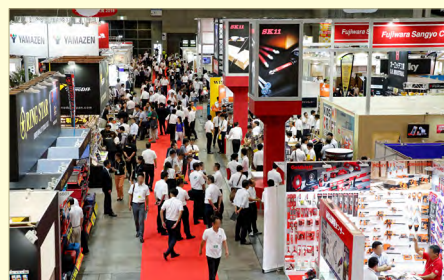
Photo from the previous show

The JAPAN DIY HOMECENTER SHOW 2019, one of the largest comprehensive trade show in Japan related to housing and living items where domestic and overseas companies related to DIY and home improvement center business gather will be held for planned 3 days from August 29 (Thursday) through 31 (Saturday) in 2019 at Makuhari Messe International Exhibition Hall in Chiba Prefecture.