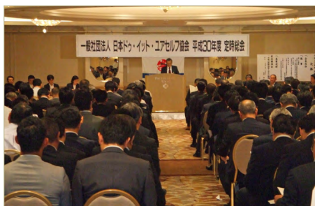
The ordinary general meeting for 2018

Satoshi Morimoto, a chancellor at the Takushoku University and a former Minister of Defense, was invited as a guest lecturer, and there was a commemorative lecture titled “The Future of International Situation and Challenges for Japan”. Afterward, there was a networking party at a different venue.