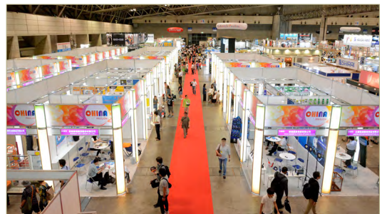
Booths of the overseas exhibitors at the 2017 show

For the details of the exhibition plans for overseas exhibitors, please go to English or Chinese official website or contact the organizer listed below.