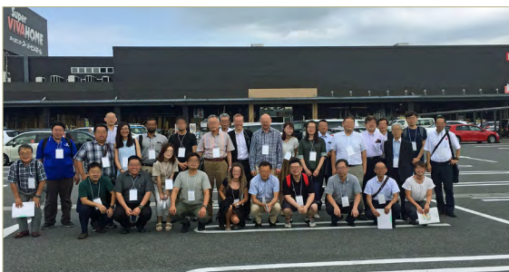
Study Bus Tour to Retail Stores

“ Study Bus Tour to Retail Stores ” is designed for overseas exhibitors to visit a big home improvement center close to Makuhari Messe on Sunday, the day following the final day of the show. During the tour, a seminar about the current market conditions of the domestic home improvement centers will be presented.