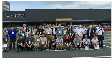
Study Bus Tour to Retail Stores

“Study Bus Tour to Retail Stores” is an observation tour of a big home improvement center and a retail store around the venue of the show that will be held on Sunday, the day following the final day of the show. Please take a tour of selling space and grasp the present condition of Japanese market.