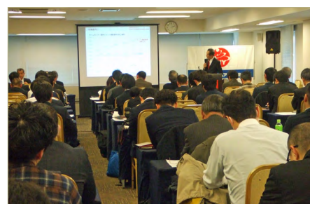
The briefing held in Tokyo