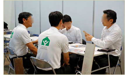
HOMECENTER BUSINESS MATCHING

“HOMECENTER BUSINESS MATCHING” is an event where exhibitors who make reservations beforehand can have direct business talks with buyers from big home improvement centers who are stationed at the special booths. It offers perfect business opportunities to the new exhibitors. Please use this event in combination with the business negotiations at your own booths. In the booth of this event and at the zone for the overseas exhibitors, English and Chinese speaking staff will be allocated.