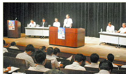
Previous briefing for exhibitors

The briefing will be held at Kameido Bunka Center (2-19-1 Kameido, Kouto-ku, Tokyo, 2-minute walk from JR Kameido station) at 1:30 p.m. on July 3 (Thursday). The detail about the briefing will be provided to exhibitors later.