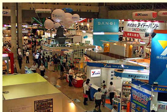
Photo from the previous show

The JAPAN DIY HOMECENTER SHOW which was held at the Tokyo Harumi Trade Fair Site, for the first time in 1978 and has been held both in Tokyo and Osaka since then will welcome its 50 th anniversary this year. The JAPAN DIY HOMECENTER SHOW 2014 will be held for 3 days on August 28 (Thursday), 29 (Friday), and 30 (Saturday) at Makuhari Messe in Chiba Prefecture, using 5 halls and 1,500 booths (planned). The show theme for the JAPAN DIY HOMECENTER SHOW 2014 is “Inspire your everyday life! Unlimited fun for your daily life with home improvement centers!”