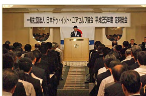
Previous ordinary general meeting held in 2013