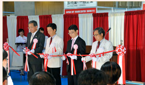
*Opening ceremony and tape cutting

The JAPAN DIY HOMECENTER SHOW 2012 was held for 3 days from August 23 (Thursday) through August 25 (Saturday) at Makuhari Messe in Chiba prefecture with Her Imperial Highness Hisako Takamadonomiya invited as the show's honorary president.