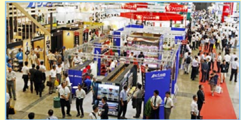
*Photo is JAPAN DIY HOMECENTER SHOW 2010

The executive committee of Japan DIY HOMECENTER SHOW 2011 will hold an annual summer big event, Japan DIY HOMECENTER SHOW 2011, for 3 days from August 25 (Thursday) through 27 th (Saturday) in 2011 at Makuhari Messe in Chiba City.